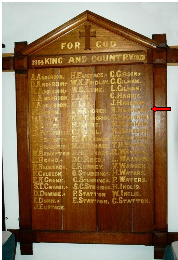
St. Luke's Anglican Church Honour Board, Zeehan