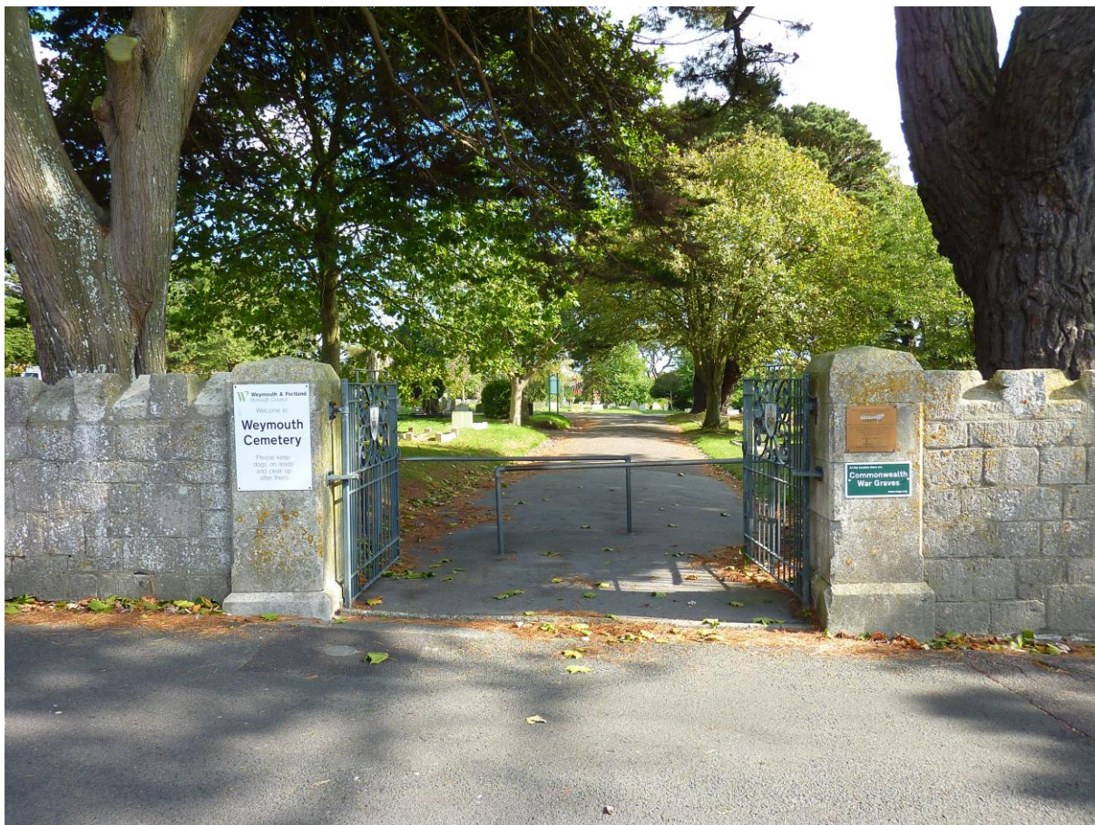
Weymouth Cemetery, Weymouth

Weymouth Cemetery contains 78 Commonwealth War Graves – 63 from World War 1 & 15 from World War 2.