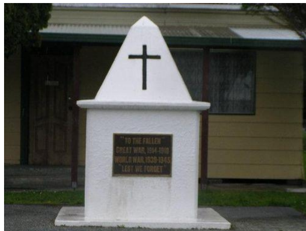
Zeehan Cenotaph

The Zeehan Cenotaph, located outside the Zeehan RSL Club, Main Street, Zeehan, Tasmania, does not record individual names.