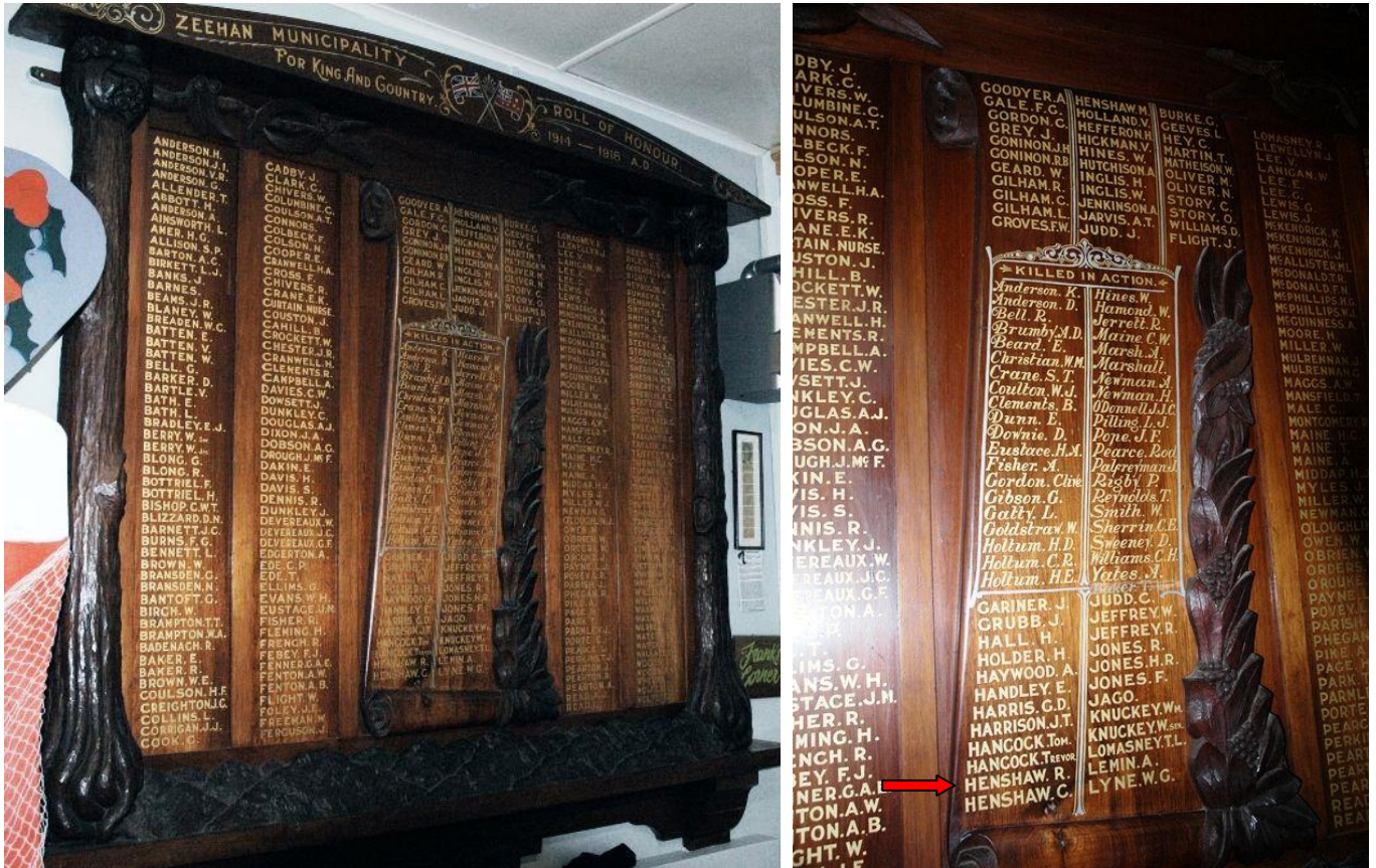
Zeehan Roll of Honour